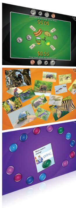
SMART Table applications – Addition Plus, Media, Multiple Choice

For teachers wanting to optimize both whole-class and small-group learning, the SMART Table is an excellent complement to the SMART Board™ interactive whiteboard. Teachers can introduce a concept to all students using the interactive whiteboard and then reinforce it through small-group activities on the SMART Table. It can also be used with the SMART Document Camera and SMART Sync™ classroom management software.